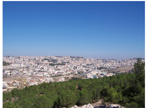
A photograph of modern-day Nazareth as viewed from the East

God chose that Jesus would arrive in an insignificant manner. His mother was a young girl from Nazareth who likely came from an honorable family, but not one that would have been viewed by their community (or nation) as worthy of having God's Son. Jesus' earthly father Joseph, equally honorable as His mother, was not a wealthy man nor was he one widely recognized for any particular skills or abilities. As we see so often in history, God chooses people who have the capacity to live in awe of Him and not those who are overly impressed or preoccupied with themselves. From these humble people Jesus learned the true meaning of life and that His time on earth was not about accumulation or making a name for Himself, but rather making a name for the God He served (and the God He was).