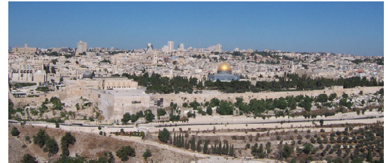
Modern view from the Mount of Olives