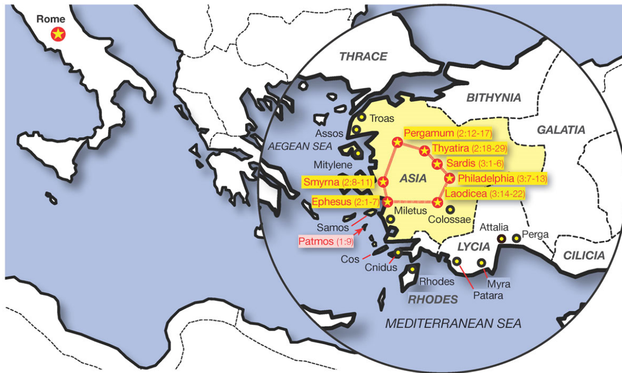
Figure 2: Map showing the Seven Churches identified in Revelation 2 and 3

In this week's lesson we focus on the first three chapters of Revelation that contains Jesus' message to the Seven Churches in Asia Minor, the modern-day country of Turkey. The map below in Figure 2 shows the location of these churches, along with the Island of Patmos where John wrote Revelation.