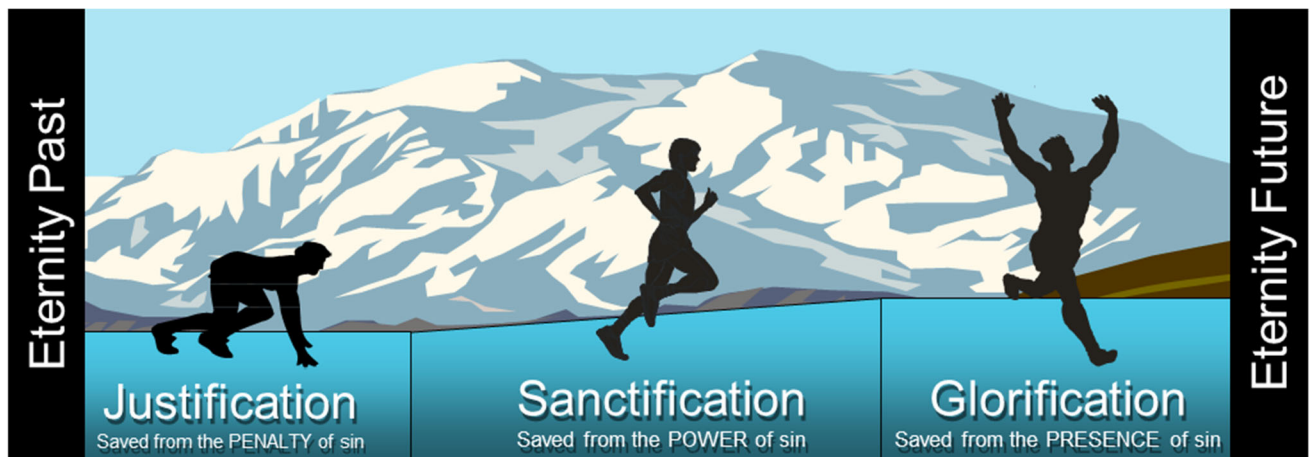
Figure 1: Understanding the three "facets" of Salvation