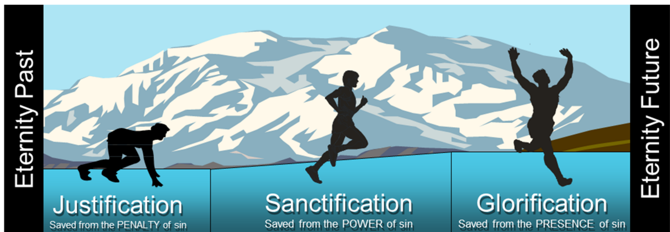
Figure 1: Understanding the three "facets" of Salvation