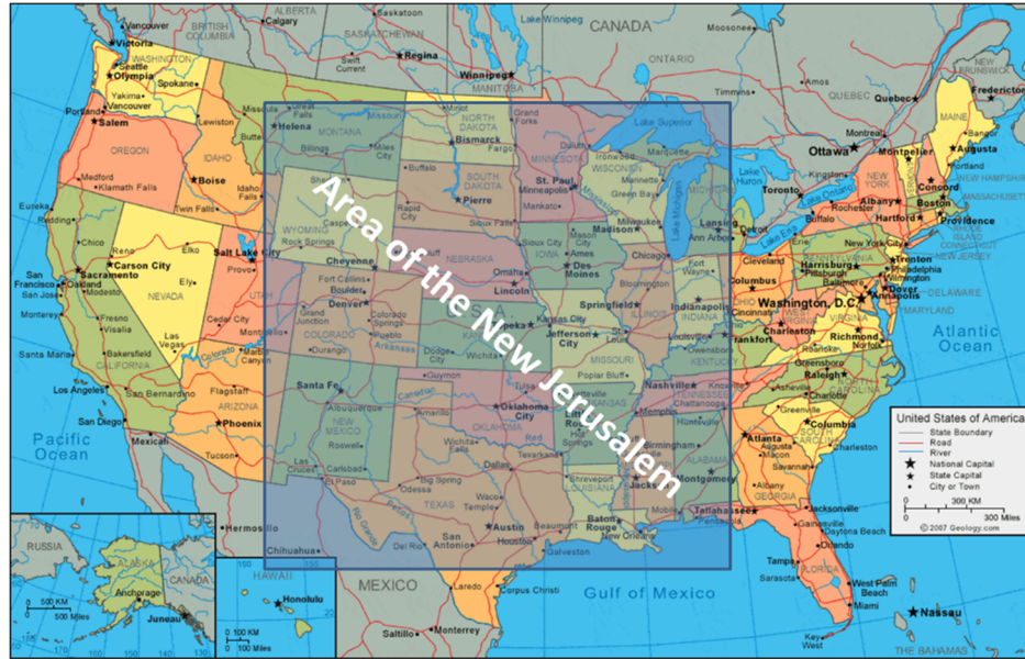
Based on measurements in Revelation 21:15-16 (1 stadia = 607 feet)