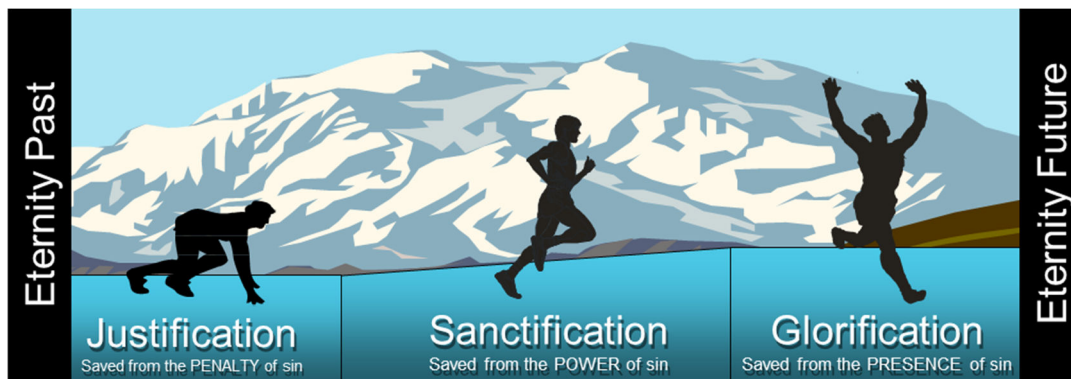
Understanding the three “facets” of Salvation